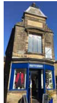
Pennybank House, Haworth